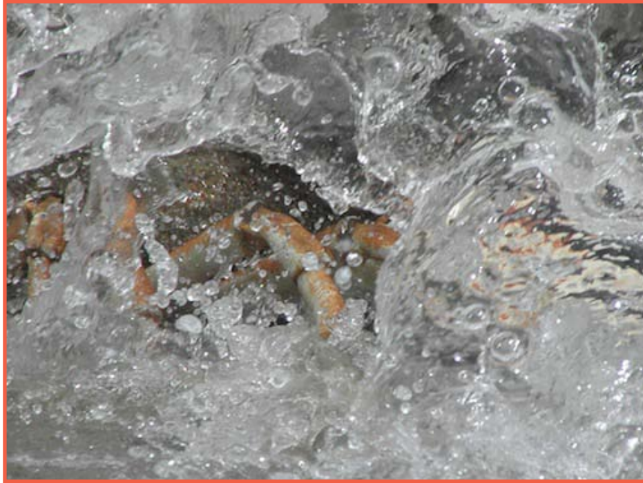
From Out of the Deep - photograph on canvas - 80 cm X 60 cm - €300 (limited edition of 5 prints)