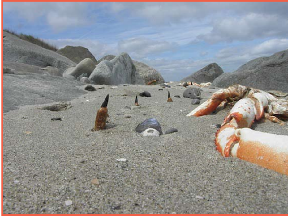
Crab Graveyard - photograph on canvas - 80 cm X 60 cm - €300 (limited edition of 5 prints)