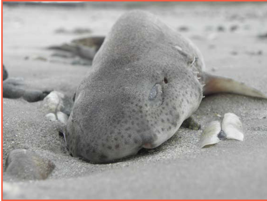
Sleeping Dogfish - photograph on canvas - 80 cm X 60 cm - €300 (limited edition of 5 prints)