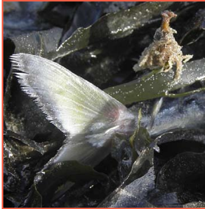
Glistening Tail (detail) - photograph on canvas - 80 cm X 60 cm - €300 (limited edition of 5 prints)