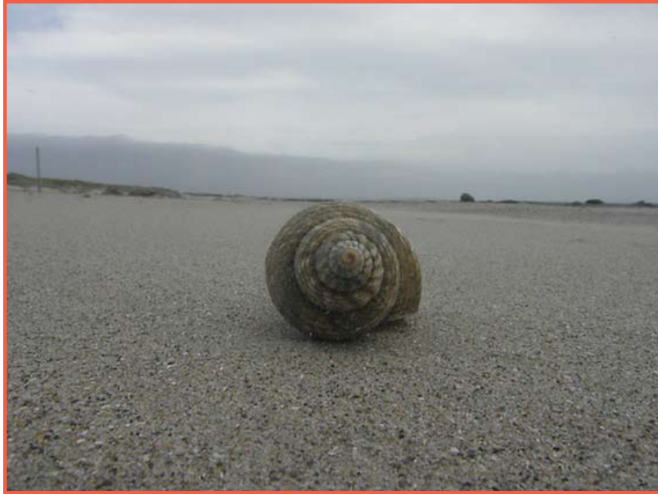
Lonely Shell - photograph on canvas - 80 cm X 60 cm - €300 (limited edition of 5 prints)