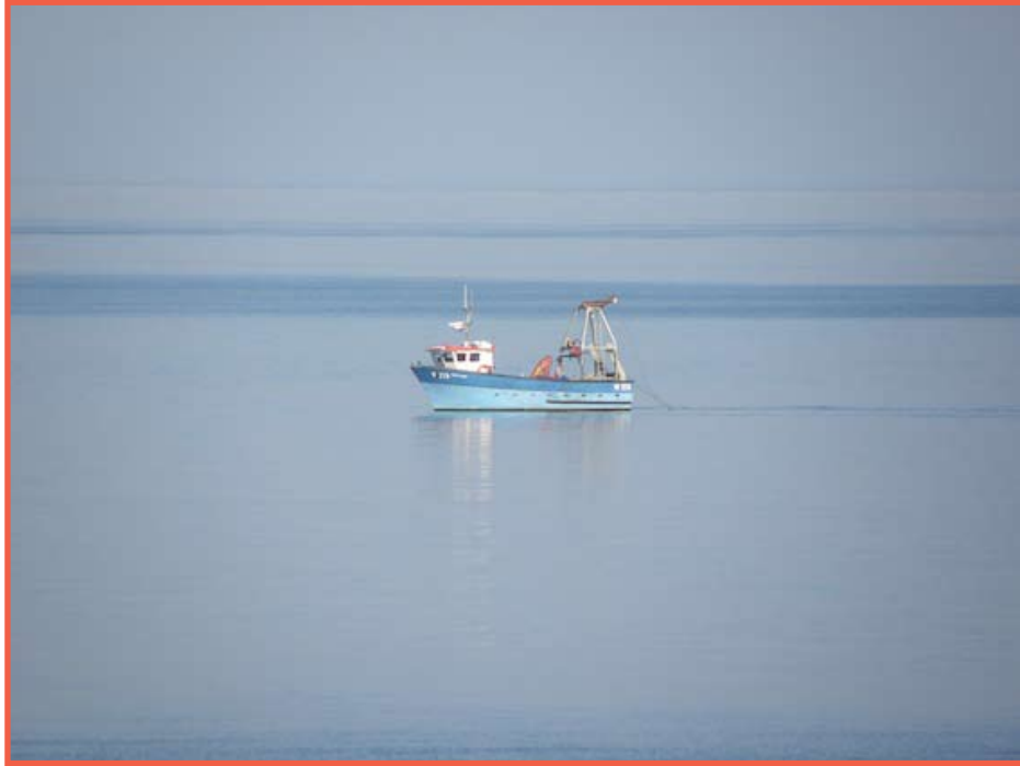
Man at Work - photograph on canvas - 80 cm X 60 cm - €300 (limited edition of 5 prints)