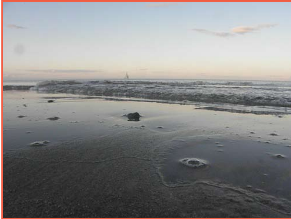
October Evening - photograph on canvas - 80 cm X 60 cm - €300 (limited edition of 5 prints)