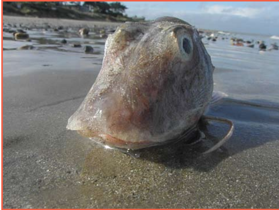
One Eyed Fish - photograph on canvas - 80 cm X 60 cm - €300 (limited edition of 5 prints)