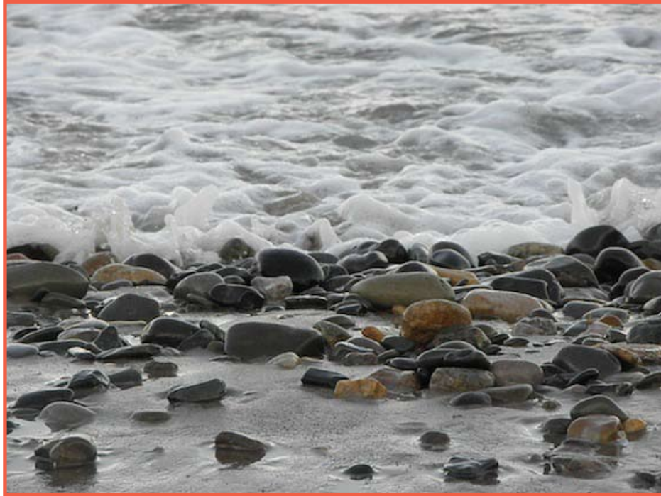
Wet Rocks - photograph on canvas - 80 cm X 60 cm - €300 (limited edition of 5 prints)