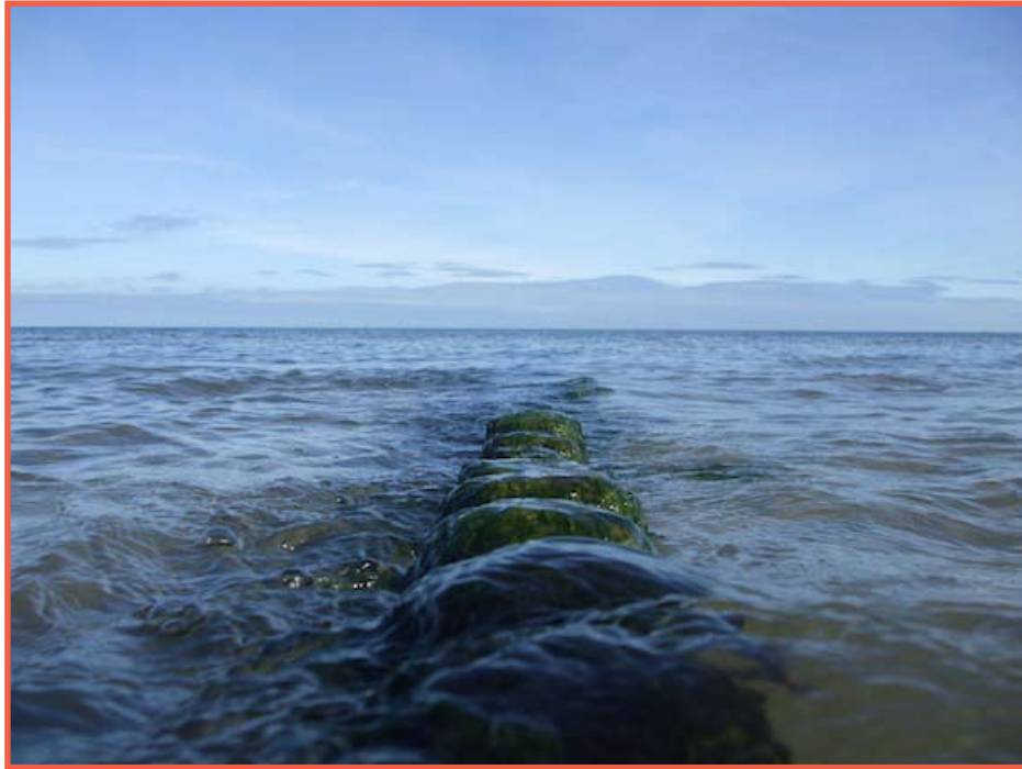
Blue Horizon - photograph on canvas - 80 cm X 60 cm - €300 (limited edition of 5 prints)