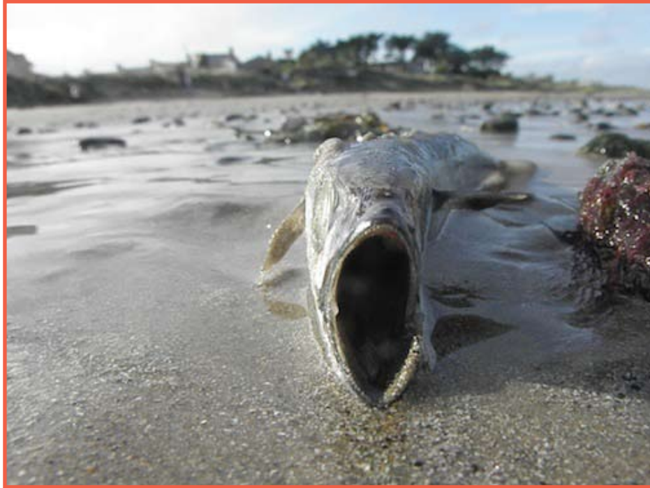
Screaming Mackerel - photograph on canvas - 80 cm X 60 cm - €300 (limited edition of 5 prints)