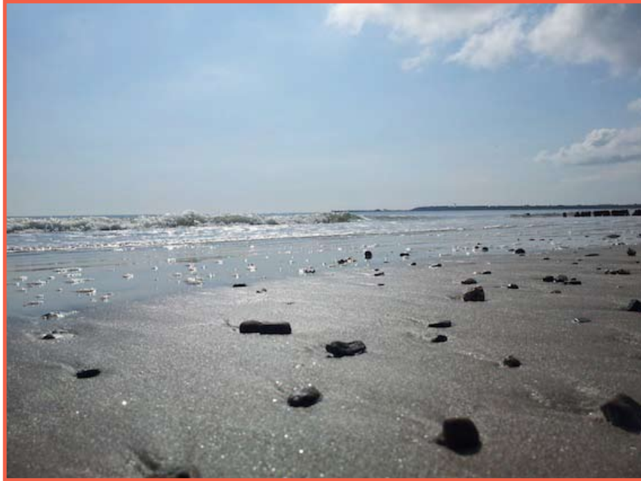
Harbour View - photograph on canvas - 80 cm X 60 cm - €300 (limited edition of 5 prints)