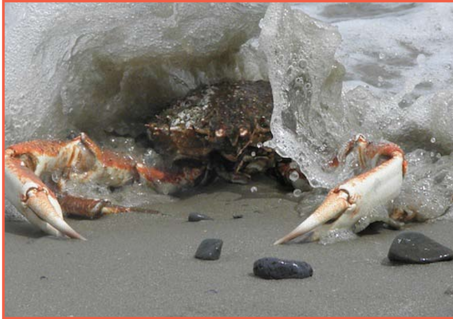
Hiding Within - photograph on canvas - 80 cm X 60 cm - €300 (limited edition of 5 prints)