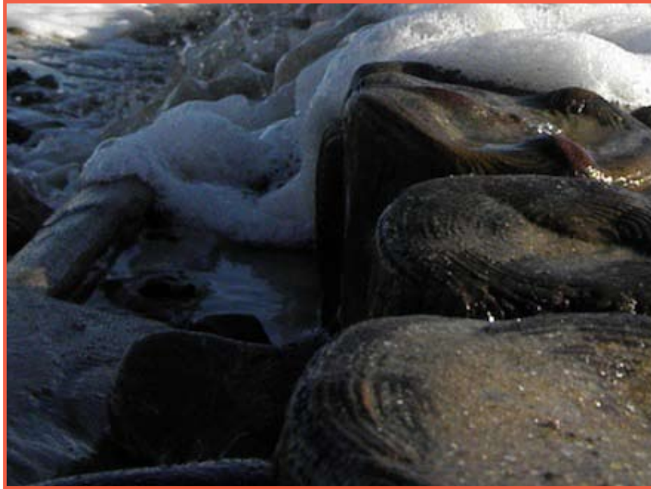
The Groyes - photograph on canvas - 80 cm X 60 cm - €300 (limited edition of 5 prints)